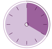
Grade 5 20 mins